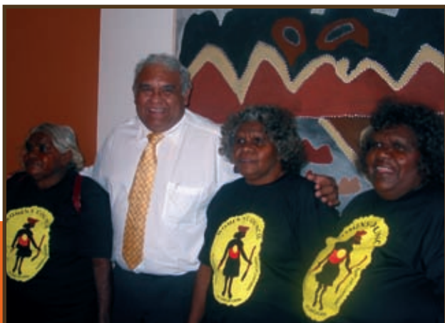
Aboriginal and Torres Strait Islander Social Justice Commissioner Tom Calma with Board Members from the NPY Women's Council, South Australia.

Policies, programs and services will only be effective if they are established and provided in ways that we can identify with and own. It is essential then