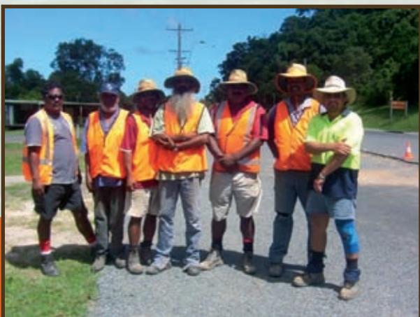
The Yarrabah Road Gang.

The case studies highlight the value of involving Indigenous peoples in policy development, implementation and agreement-making and demonstrate that the best outcomes for Indigenous peoples are achieved when agreements are informed by principles and practices that support Indigenous self determination.