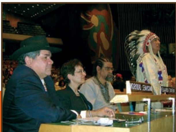
Members of the United Nations Permanent Forum on Indigenous Issues, including Mick Dodson, participate in the opening session for 2006.

The Declaration, currently before the United Nations General Assembly, will be of the utmost importance in combating discrimination against indigenous peoples.