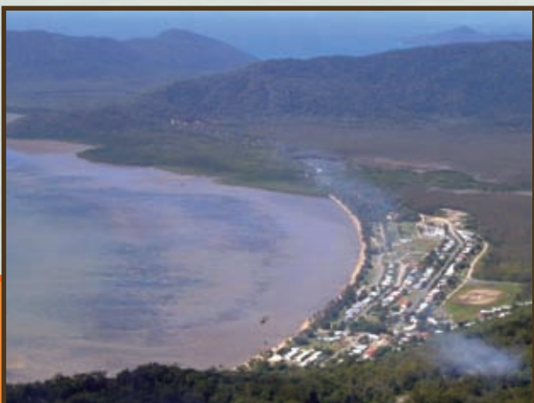
Aerial view of Yarrabah.

For more detailed survey results, see Chapter 1 of the Native Title Report 2006 .