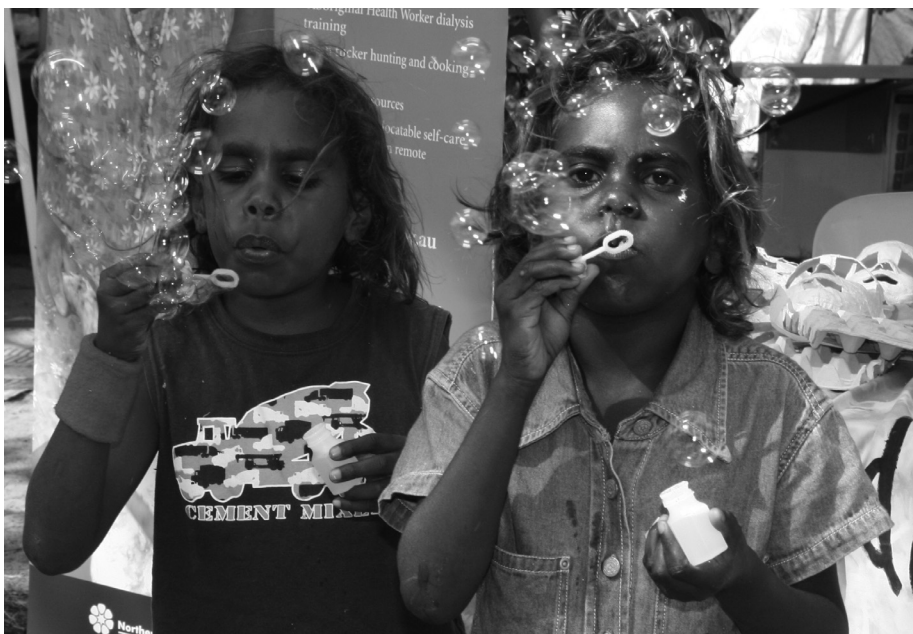
..... Children blow bubbles at the GARMA Festival of Traditional Culture at Nhulunbuy, NT

The Campaign for Indigenous Health Equality Within a Generation , address to South Australian Department of Premier and Cabinet, Adelaide, 18 September 2007.