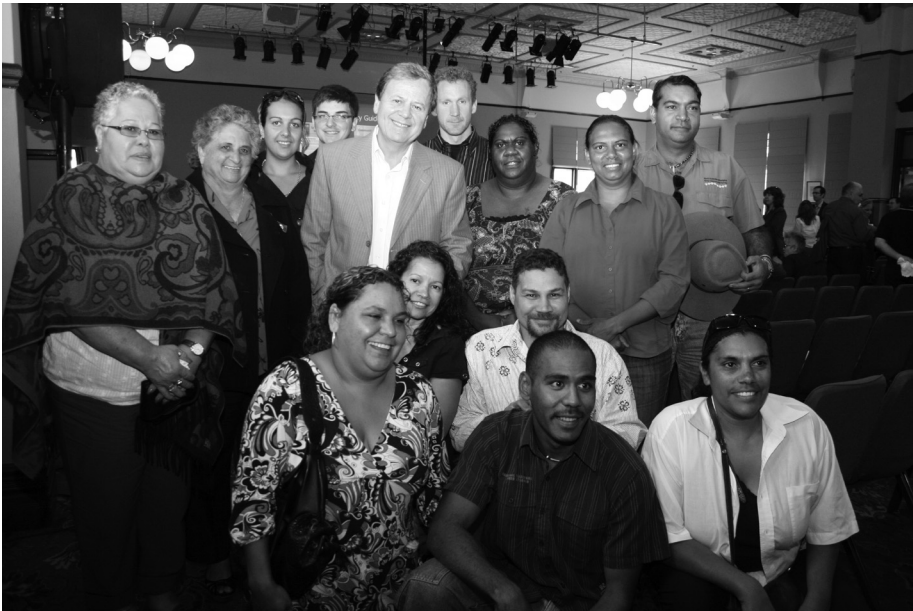
..... Participants in the Indigenous Community Legal Education Project for Family Violence Services pose with Ray Martin, who MC'd the launch of the Native Title Report 2007 . This year's Report was dedicated to the memory of Eddie (Koiki) Mabo, commemorating 10 years since the High Court's Mabo decision

The Native Title Report 2007 , fact sheets and media release are available on-line at www.humanrights.gov.au/social_justice/nt_report/ntreport07/index.html .