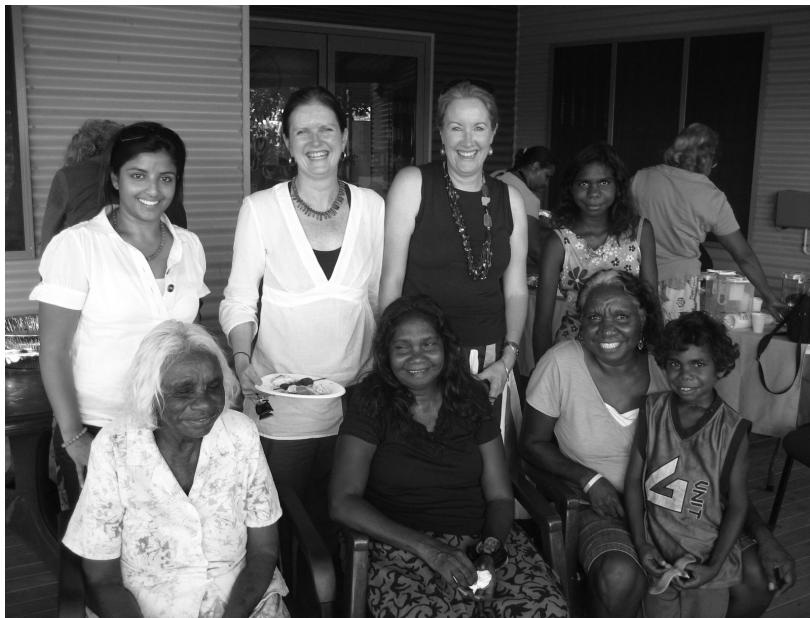
..... The Commissioner with two staff members at the Fitzroy Crossing Community Consultation of the Listening Tour

The Sex and Age Discrimination Unit contributes to legislative developments by making written and oral submissions to parliamentary and other inquiries. A list of these submissions can be found in Chapter 3 of this report, Monitoring Human Rights .