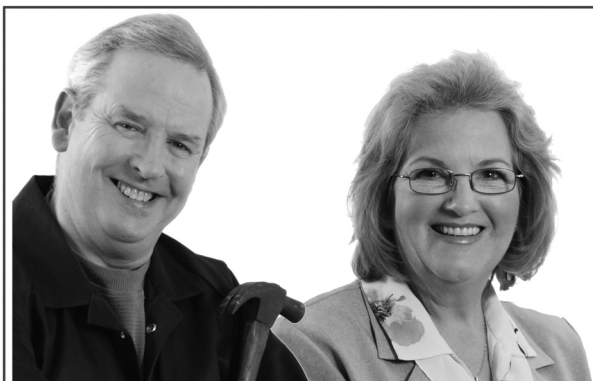
MATURE WORKERS MEAN BUSINESS

As one of the recommendations arising out of social research commissioned by HREOC, a print media and web-based campaign was developed during the reporting period to promote the benefits of employing mature age workers. The Mature Workers Mean Business campaign includes positive case studies from mature age workers and their employers and addresses a range of myths and stereotypes regarding older workers. The campaign also highlights the relevance of age discrimination protections in the workplace. The campaign will be launched in the next reporting period.