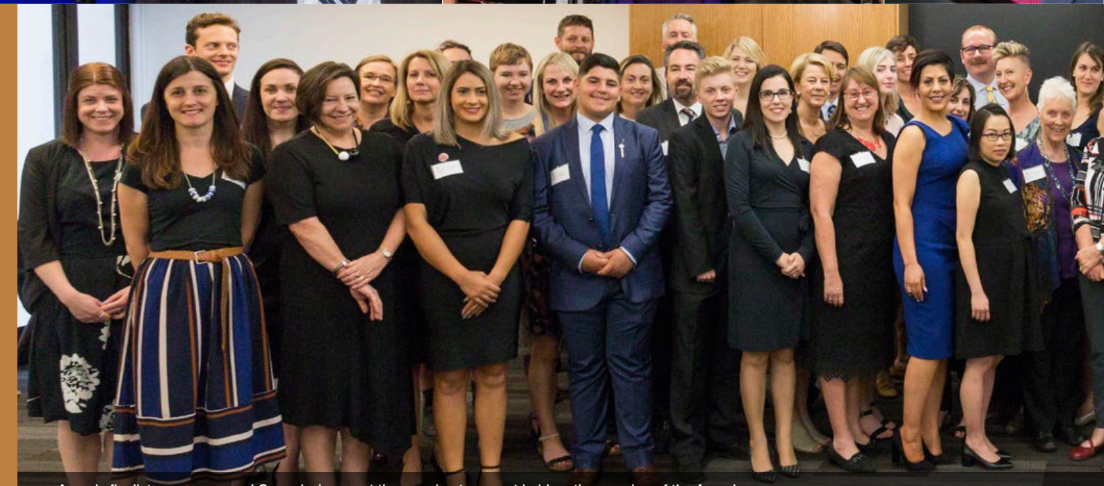
Awards finalists, sponsors and Commissioners at the morning tea event held on the morning of the Awards ceremony.