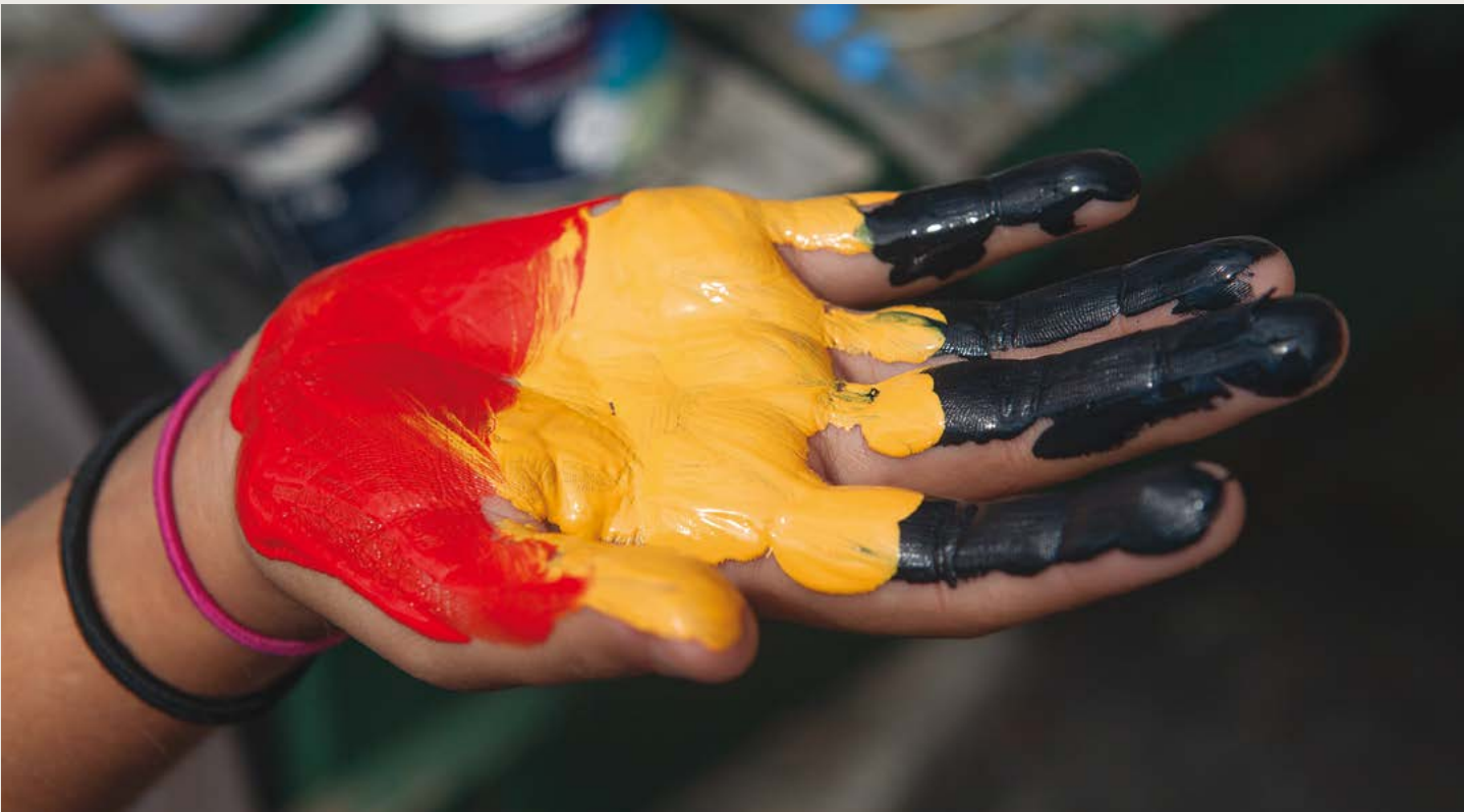
Nowra High School's Close the Gap Day. Nowra, NSW.