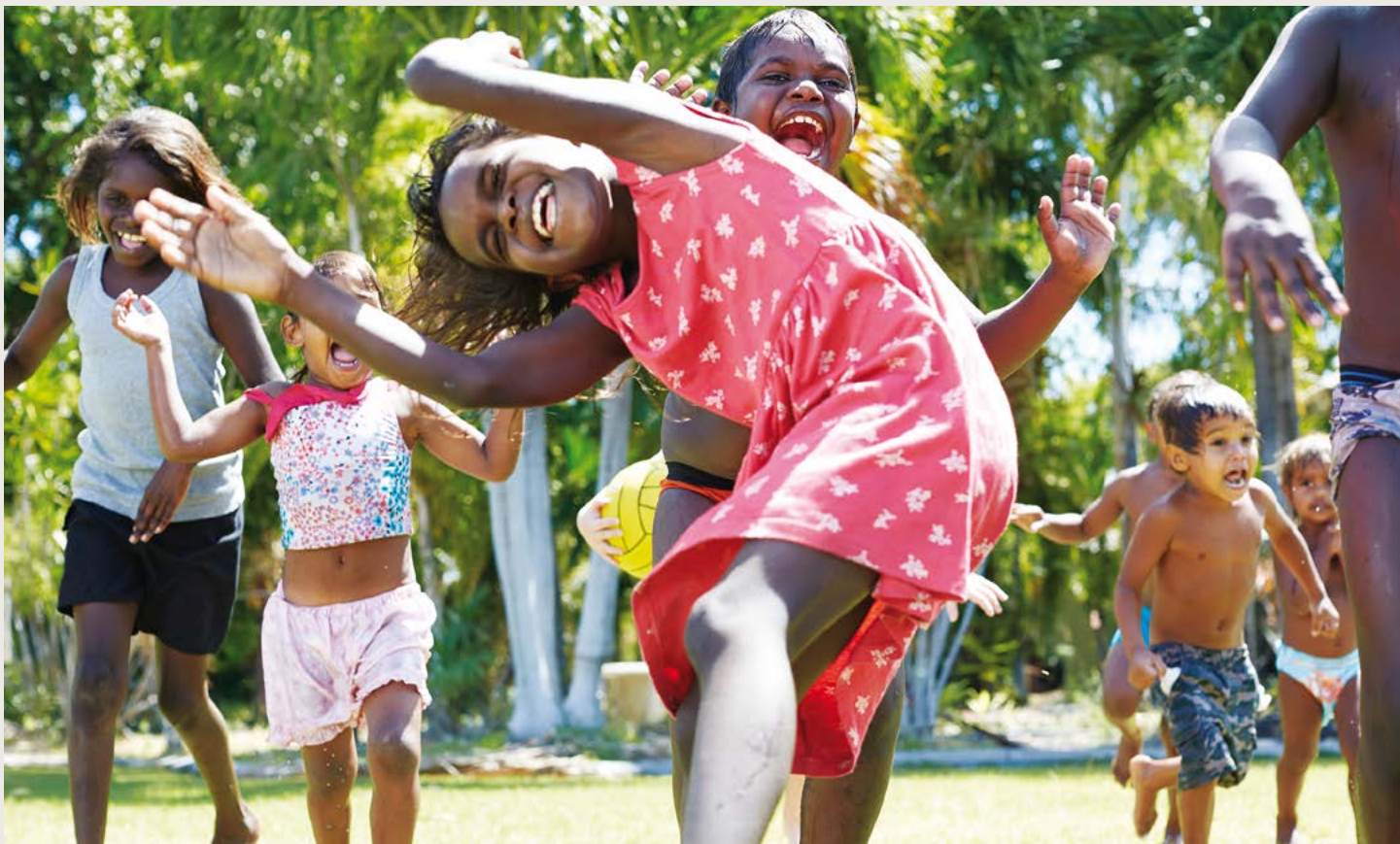
Binning kids and Children’s Ground participants playing at the pool in Jabiru, NT.