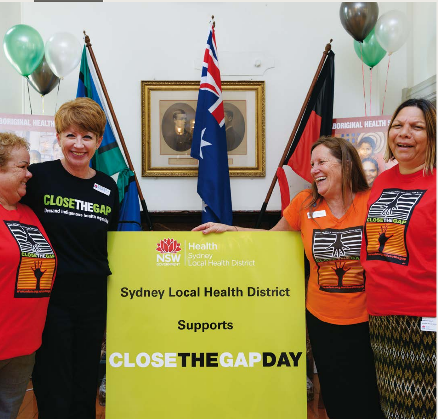
National Close the Gap Day celebrations at Royal Prince Alfred Hospital, Sydney, NSW.